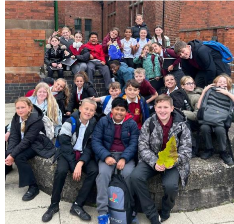
TABLE TENNIS FINALISTS – GO GH!

On Tuesday 29th October, Year 6 visited the Abbey Pumping Station in Leicester. They visited as part of their work on Victorians to see one of the remaining Victorian buildings in the city. They spent some time looking at the amazing building, beam engine and museum. They played with some Victorian games, investigated friction for their Science work and took their sketch books and were artists as they sketched patterns they could see in the engines. They were superbly behaved and very engaged in all they saw. A great day!