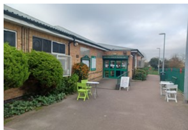
Glen Hills Library and Cafe