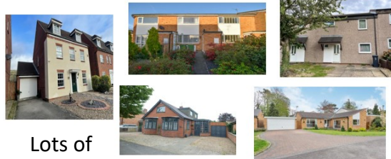
Lots of different houses in Glen Parva