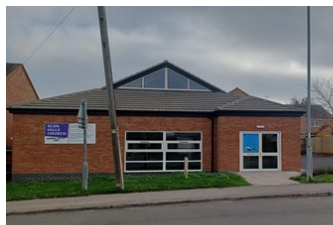
Glen Hills Church