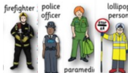
People Who Help Us